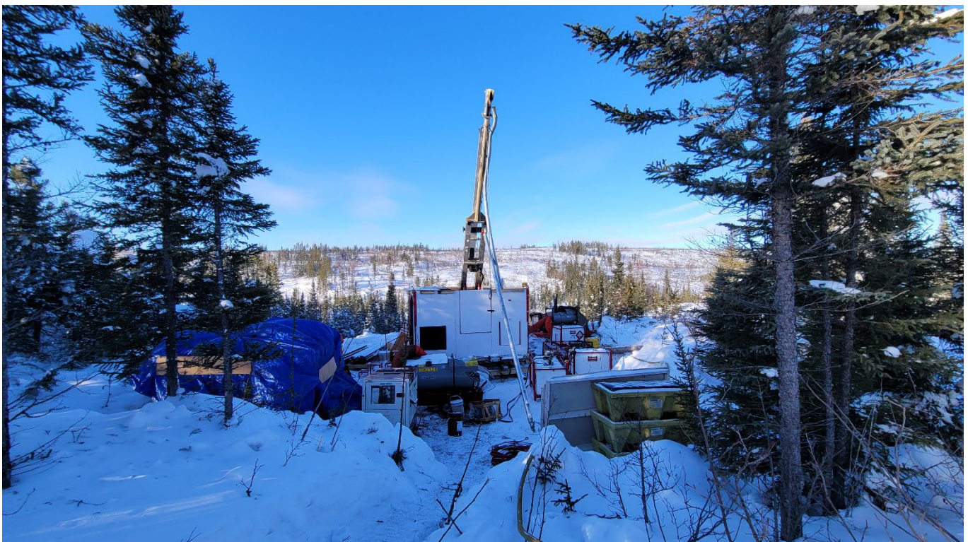
Figure 1: First drill hole at Hook Lake

Valor Resources Limited (Valor) or (the Company) (ASX:VAL) is pleased to announce the Company's maiden diamond drilling program at the Hook Lake Uranium Project. The Hook Lake Project is located in the world class uranium province, the Athabasca Basin in Saskatchewan, Canada.