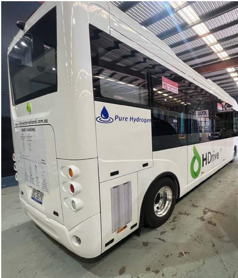
Picture of a Hdrive Bus