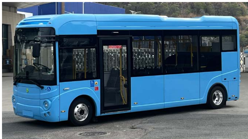
Picture of HFC Mini Bus

In accordance with the MOU, the VAHC has expressed interest in up to three hydrogen fuel cell (HFC) minibuses, and two HFC Coaches, to be supplied by Pure Hydrogen and manufactured by Pure Hydrogen subsidiary Hdrive International.