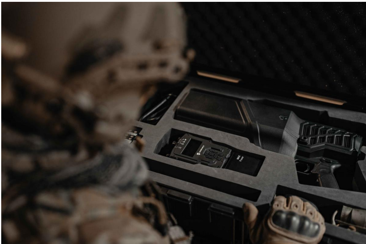
Image: DroneShield’s Immediate Response Kit – DroneGun Mk4 and RfPatrol Mk2