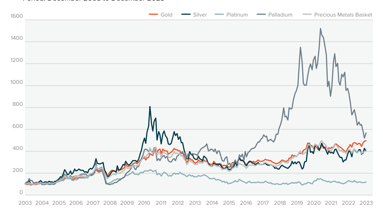
(i) Chart 1: Cumulative Return for Gold, Silver, Platinum, Palladium and Precious Metals Basket Period: December 2003 to December 2023