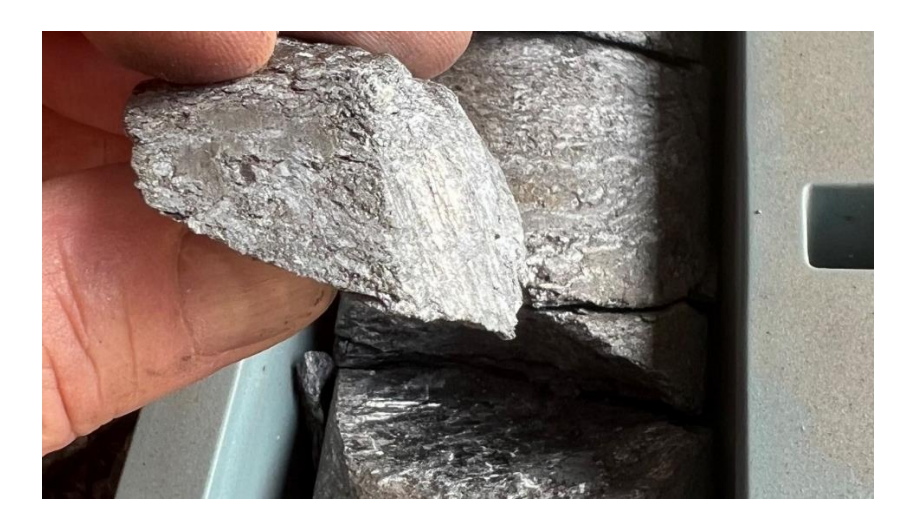
Figure 3: Graphitic Schist from LEDD_3 at 18.5m (interval 18-19m assayed 11.3% TGC)

It is apparent from Table 1 that the concentrate grades and recoveries are somewhat variable with TGC grades from 89.0% to 95.1% and flotation recoveries from 45.3% to 92.4%. All of this material, higher grade and lower grade, along with lower recovery and higher recovery, has been included in this initial bulk sample. The recently completed infill drilling program at Leliyn has enabled the delineation of graphitic schist horizons with potentially more favourable metallurgical characteristics.<sup>3</sup> It may be possible to visually assess the graphitic schist that produced the higher concentrate grades and recoveries in Table 1. The more friable, 'flaky' material, often with several percent sulphides (pyrite, pyrrhotite) provides a higher quality concentrate. Figures 3 and 4 show graphitic schist of this nature.