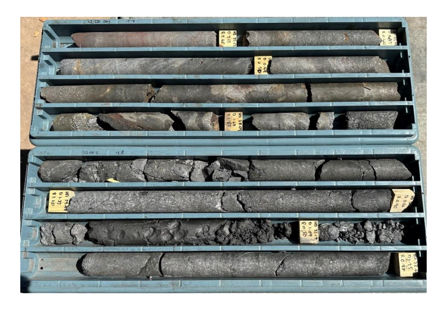
Figure 4: LEDD_05 25m-33m (13.4% TGC)