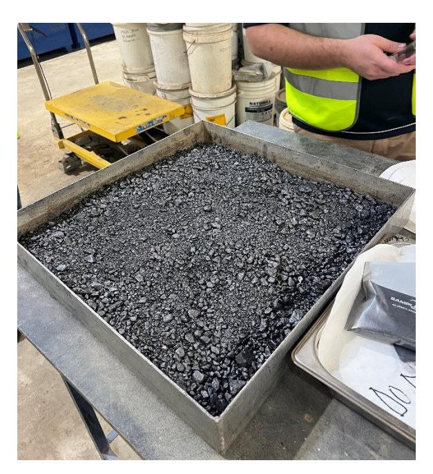
Figure 2: 5kg sample of graphite concentrate ready for packaging and dispatch to Germany