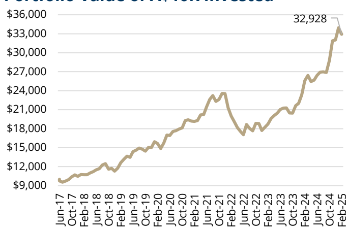
Notes: 1. Calculations are based on the portfolio return in AUD and calculated before expenses and after investment management and performance fees. Portfolio value includes the reinvestment of dividends and income. Source: AGP International Management Pty Ltd.