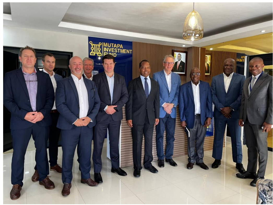
Figure 3 - Invictus Energy meeting with Mutapa Investment Fund in March 2025

The revised agreement is in its final stages of preparation and is being fast-tracked for execution in the coming weeks.