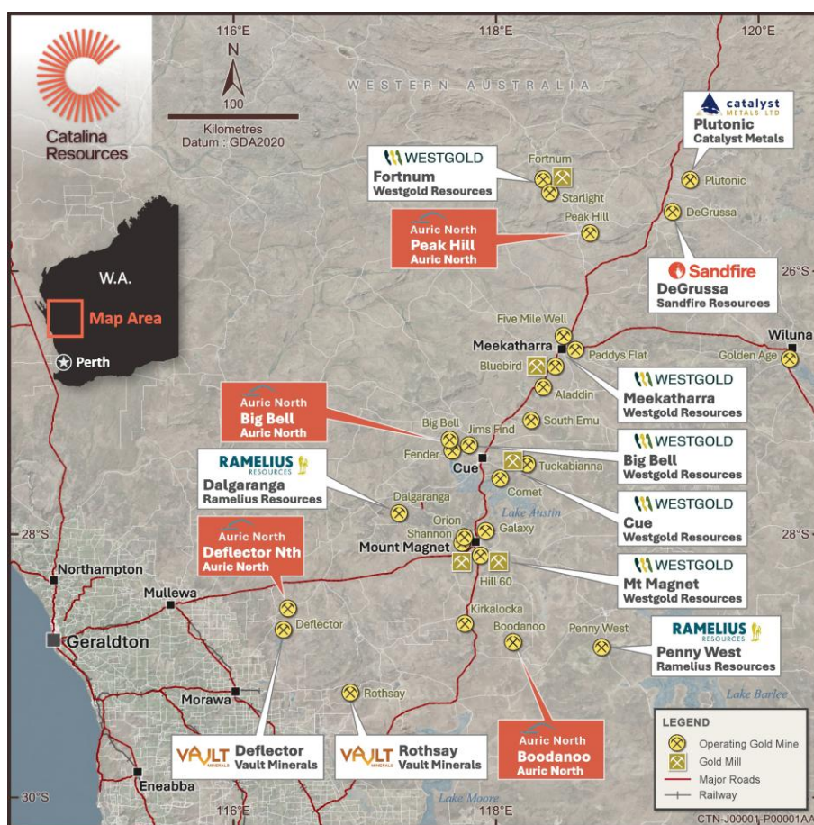
Figure 3. Auric North's Mid-West Region Project Portfolio

pathway to materially expand its exploration footprint at a time when high-quality greenstone positions are increasingly scarce across the State.