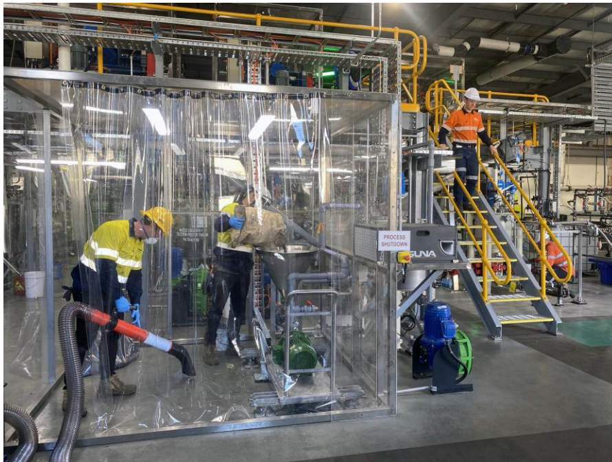
Figure 1. Graphite feedstock being introduced into Renascor’s PSG demonstration facility in Adelaide

Once operational, the facility will demonstrate Renascor’s HF-free purification process, positioning Renascor as a globally competitive alternative to China’s PSG supply chain.