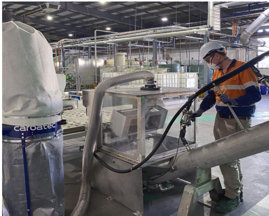
Figure 3. Equipment performance checks at Renascor's PSG demonstration facility

Following completion of pre-commissioning activities, commissioning of the PSG demonstration facility is now underway, with activities focused on operating the plant under integrated conditions and progressing toward the production of battery-grade graphite.